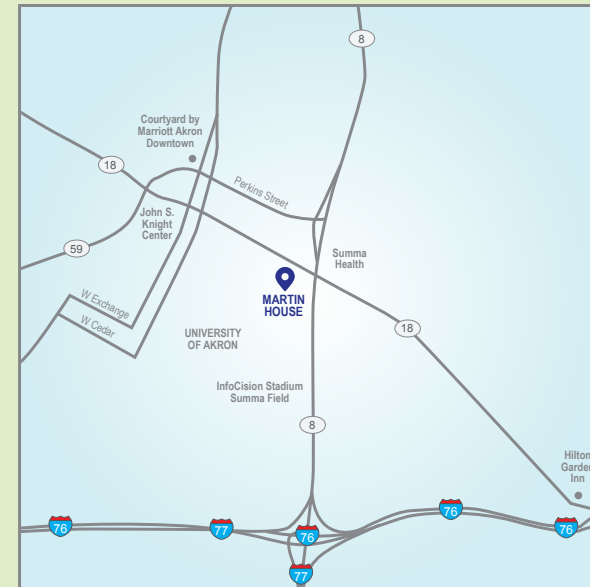
MARTIN HOUSE, 105 Fir Hill Drive, Akron, OH 44325